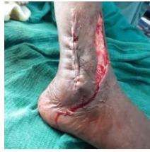
Case2 -Lower 1/3 defect