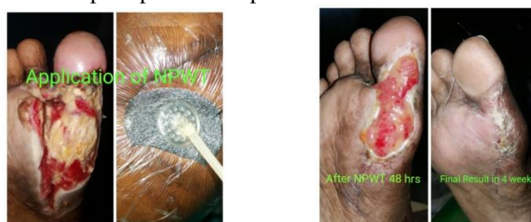
Table I – Assessment of ulcer size:

Measurement of ulcer in square centimeters, measurement of granulation tissue in square centimeters, documentation of compliance and associated therapy were carried out and results tabulated. One patient withdrew from Group- A because of poor patient compliance.