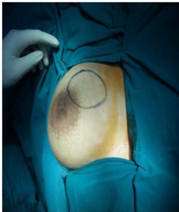
Fig1: Fibroadenoma breast

was found to be distributed among all age groups. Among total 6 cases 2 patients were of 21-30 age group, 3 patients of 31-40 age group and one patient of more than 50 years old. Among the 3 lipoma cases 2 patients belonged to 11-20 years age group and one patients was of 34 years old. Galactocele was found in the age group of 21-30 years old.