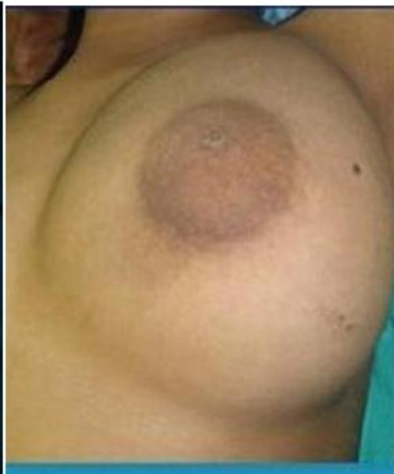
Fig: Phylloides tumour