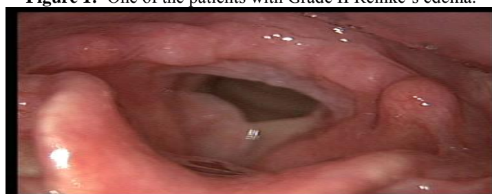
Figure 1: One of the patients with Grade II Reinke's edema.

This retrospective study included 24 patients of either sex meeting the inclusion criteria with age ranging from 22 to 56 years who presented to the ENT department with complaints of hoarseness secondary to Reinke's edema (Grade II or III) ( Figure 1 ). Patients with hoarseness secondary to other laryngeal lesions, contraindications to surgery, unwilling for surgery and noncompliant for follow up were excluded. The patients underwent a thorough ENT examination and general physical examination for any associated systemic illness. Patients with history of smoking were counseled for cessation of the same and all the patients were referred to the speech therapist for a pre and postoperative counseling.