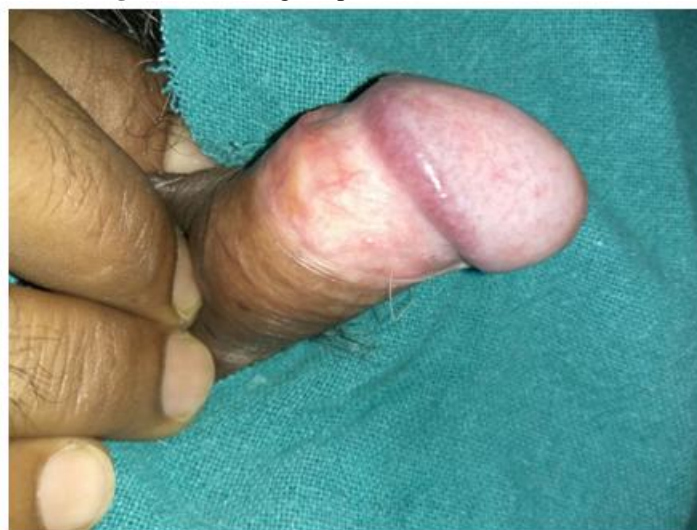
Figure 3. Five months after application of 5-fluorouracil ointment