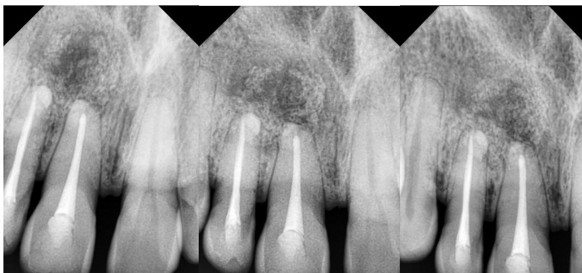
Fig 4: 3 months follow-up IOPAR Fig 5: 6 months follow-up IOPAR Fig 6: 12 months follow-up IOPAR