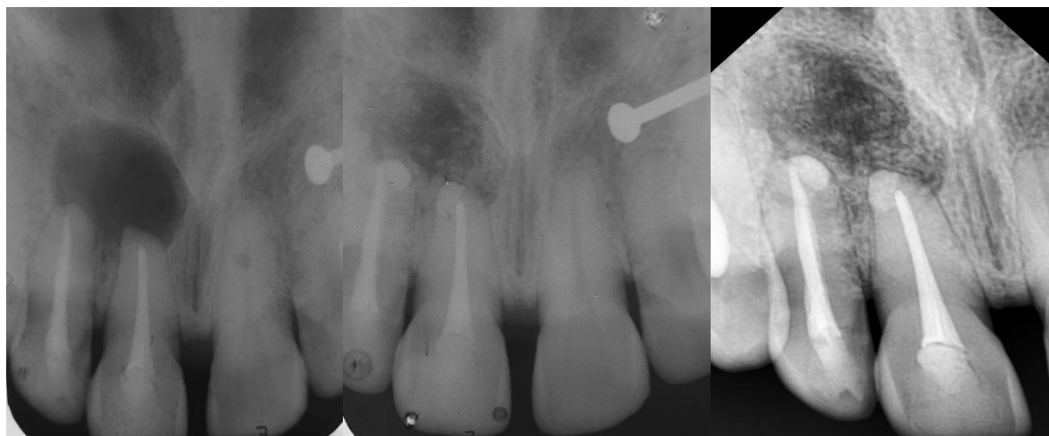
Fig 1: Post-obturation IOPAR Fig 2: 1 week follow-up IOPAR Fig 3: 1 month follow-up IOPAR

A 42-year-old female patient reported with a chief complaint of discolored upper front tooth and intermittent pus discharge from the gums in relation to the tooth since 4 years. History revealed trauma to the same region 5 years back. Clinically slightly discolored 11 with sinus tract opening was seen. Intra oral radiographic examination revealed well-defined radiolucency involving 11 and 12 region and endodontic treatment was initiated. 3 months post obturation there was evidence of sinus opening and hence surgery was planned. 3 mm thickness of Biodentine was placed as retrograde restorative material. Follow up was done at time intervals of 1, 3, 6, and 12 months to evaluate healing.