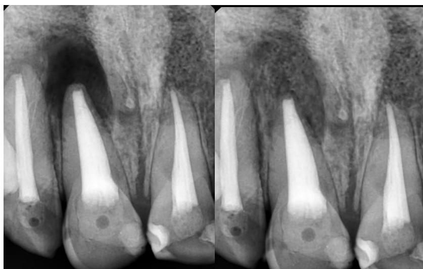
Fig 4: 6 months follow-up IOPAR Fig 5: 12 months follow-up IOPAR