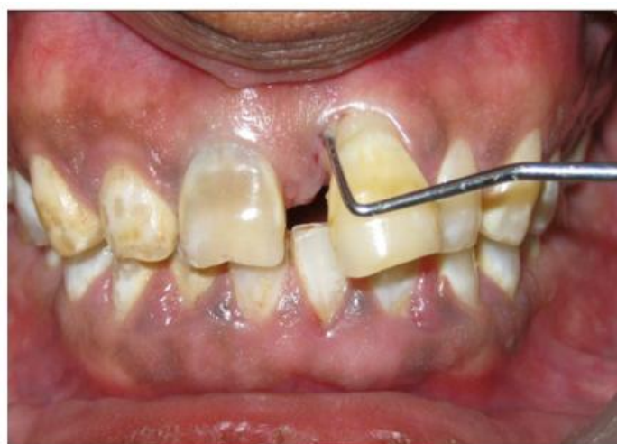
Photograph 8. Clinical picture of a localized aggressive periodontitis (LAP) patient