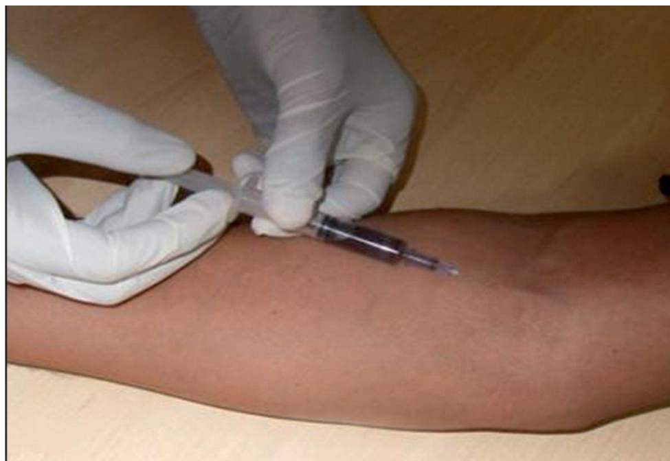
Photograph 3. Procedure of blood collection