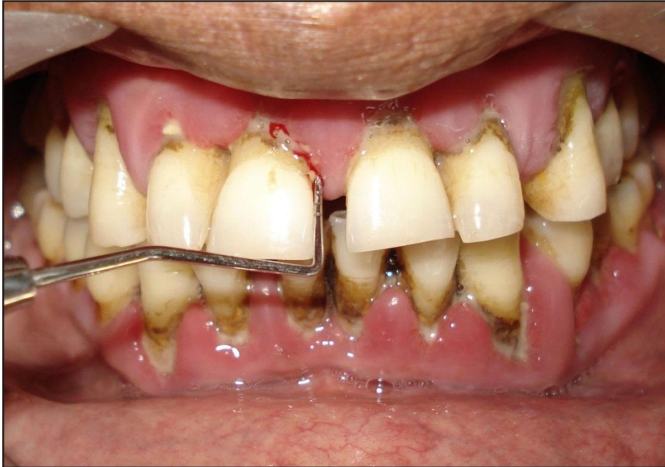
Photograph 9. Clinical picture of a generalized chronic periodontitis (GCP) patient