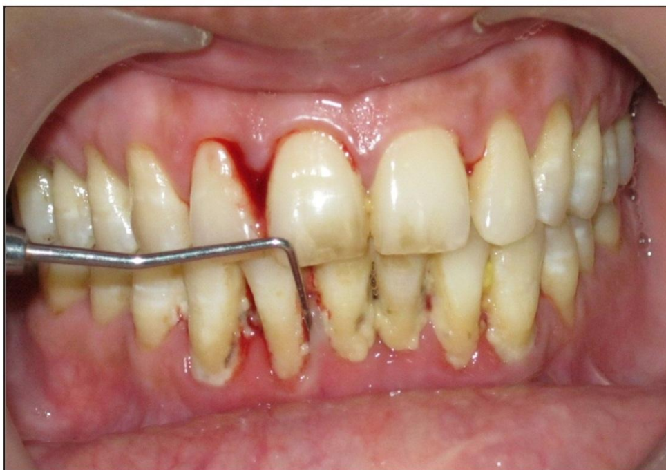
Photograph 10. Clinical picture of a localized chronic periodontitis (LCP) patient