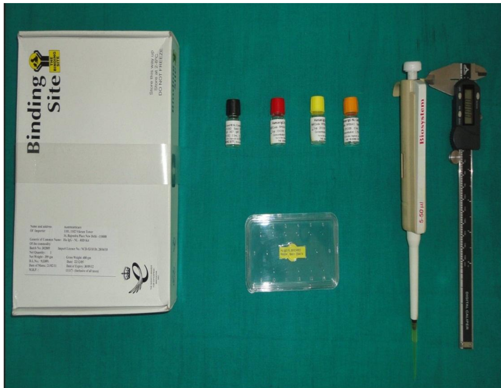
Photograph 4. Armamentarium for estimation of Serum IgG by Radal immunodiffusion technique (RID Assay)