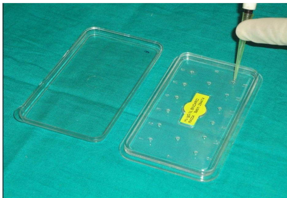
Photograph 5. Procedure of Radial immunodiffusion technique (RID Assay)