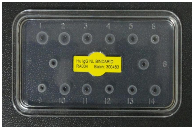
Photograph 6. Immunoprecipitation rings after incubation period of 48 hours