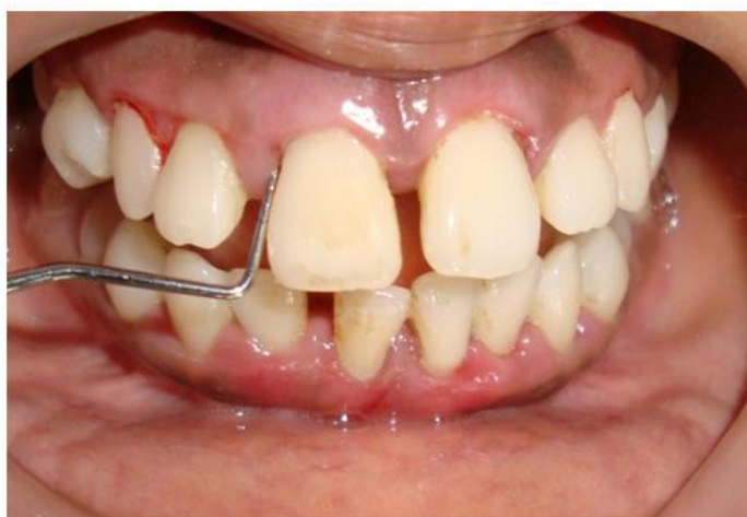
Photograph 7. Clinical picture of a generalized aggressive periodontitis (GAP) patient