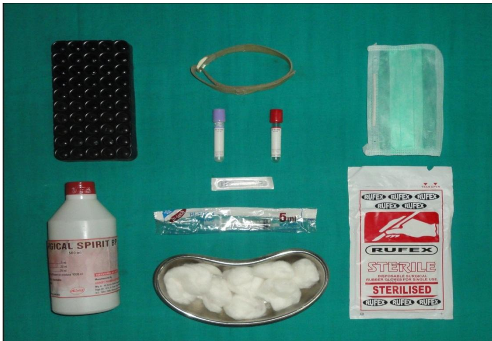
Photograph 2. Armamentarium for blood collection procedure