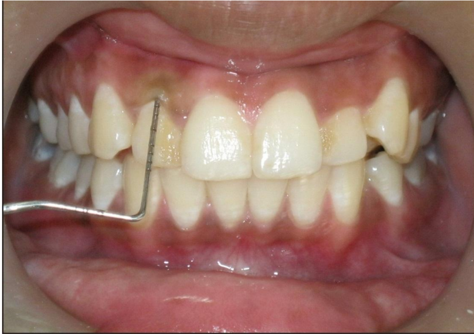
Photograph 11. Clinical picture of a patient with healthy periodontal status (HPS)

Dr. Saifuddin Dhoondia”“Comparative evaluation of Serum Total IgG in Aggressive and Chronic Periodontitis patients – An Immunoanalytical study”. “IOSR Journal of Dental and Medical Sciences (IOSR-JDMS), Volume 17, Issue 2 (2018), PP 63-72.