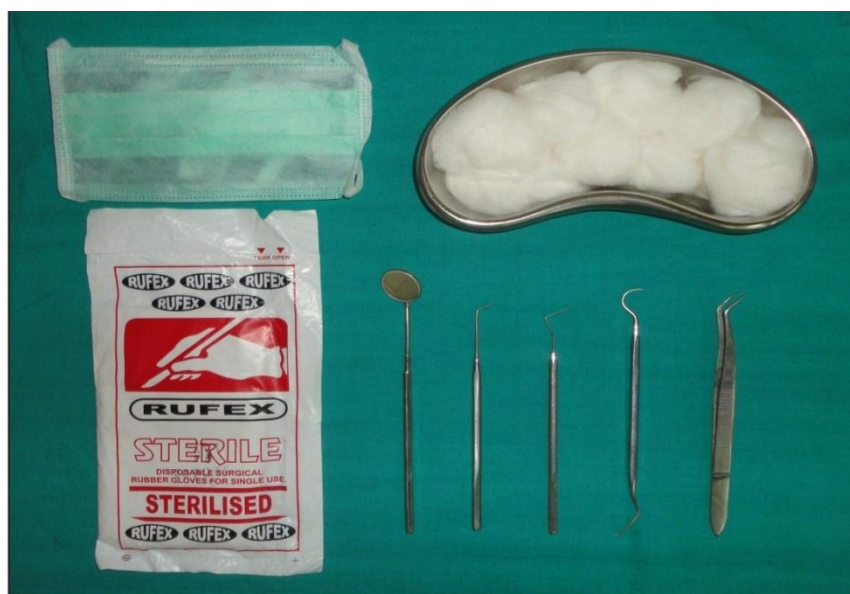
Photograph 1. Armamentarium for clinical diagnosis