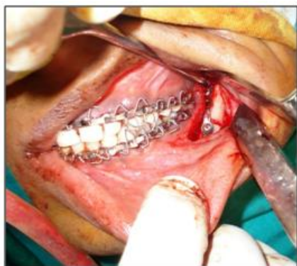
Figure 2c The fracture in left angle region of mandible immobilized by fixing the miniplate with screws.