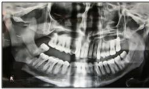
Figure 1a Orthopantomogram of a patient showing fracture of right angle region of mandible.

Case 1: Fracture of right angle region of mandible managed via extraoral approach. (Representative case)