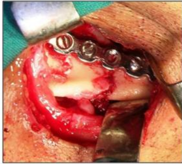
Figure 1c Fractured fragments immobilized by fixing the plate in the angle region of mandible.