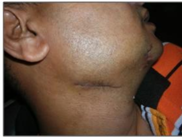
Figure 1d The scar seen in the submandibular region.