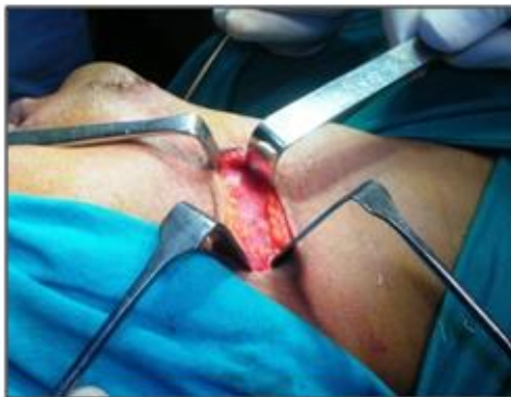
Figure 1b Submandibular dissection for exposing the angle region of mandible.