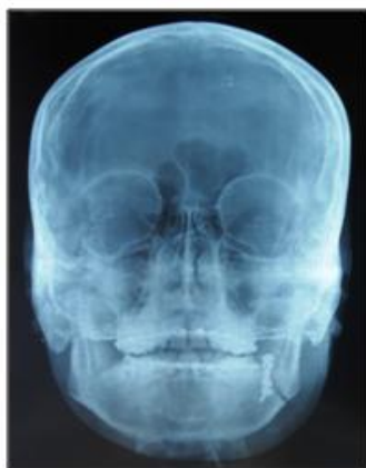
Figure 2e PA Skull view showing the plate fixed along the external oblique ridge in left angle region of mandible.