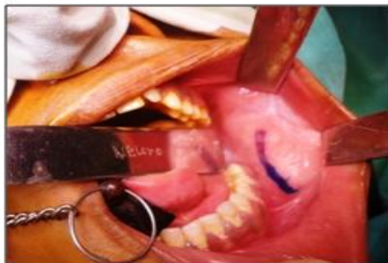
Figure 2b The site where the incision is to be placed is marked with the marking ink.