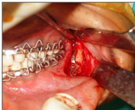
Figure 2d The plate is recontoured for adaptation along the external oblique ridge.