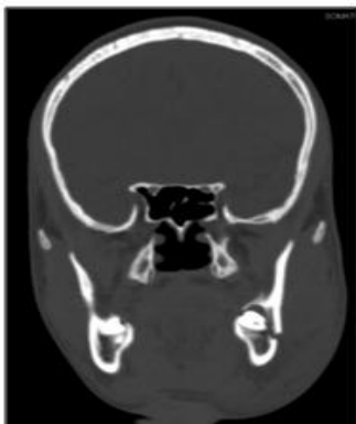
Figure 2a Coronal section of the CT scan of facial skeleton of a patient showing fracture of left angle region of mandible.