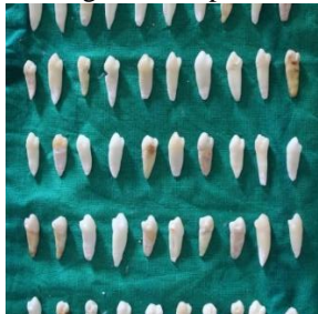
Figure 1: single rooted premolar samples