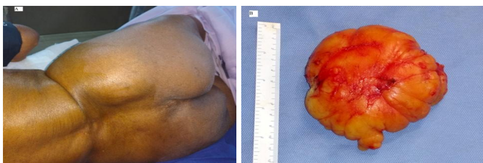
Fig-2 (A) Giant lipoma on the right gluteal region (B) excised specimen of lipoma

A 75 –year old female presented with a swelling on the right gluteal region (Fig2A) of 30 year duration, which was progressively increasing in size. It was initially painless, but developed dull aching pain in the swelling associated with difficulty in the sitting in last three monts. Local examination revealed a swelling of size 11 ×10×4 cm on the right gluteal region (Fig2A). It was non-tender, ovoid shaped, soft in consistency, smooth surface with well defined margins and mobile in all direction. Hip movements were normal. X-ray of pelvis with hip joint was normal.