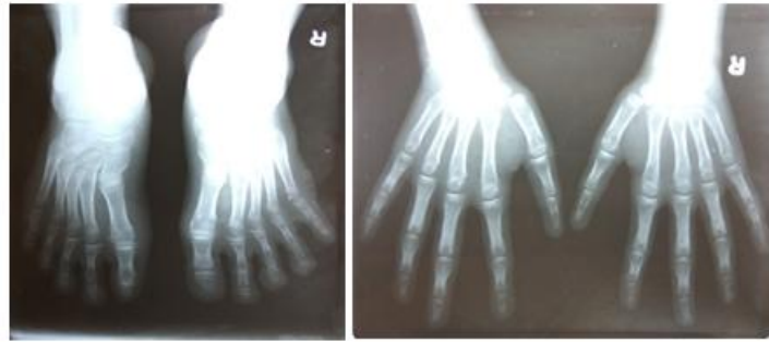
Figure 4A, 4B