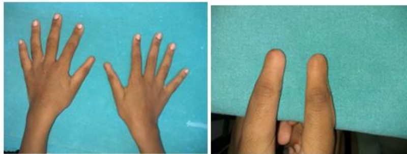
Figure 3A, 3B