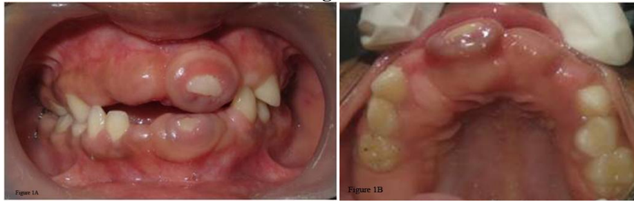
Figure 1A, 1B