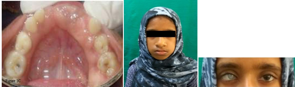
Figure 1C, 2A, 2B