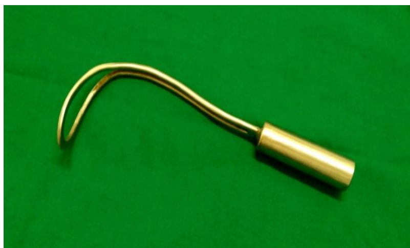
Fig1. SR Cephalic extractor with application blade, shaft, and handle.

After opening the lower uterine segment, head should be lifted up a little with left fingers, and then the blade inserted with right hand (Fig 2, A&B). While applying, the concave surface of the blade should face the legs. Maintaining the head elevation with fingers, the blade should be rotated to 180 degrees (C&D). While doing this, the hallow surface of the blade easily slips on to the convex surface of the head. With little manipulation, stable position of the blade can be attained, and then traction should be applied. If the blade slips after dislodging the head from first position due to traction (pull), the blade should be reset in another favorable position, and then traction (pull) should be applied. In a case of deeply engaged head, the head should be dislodged from deep pelvis by pushing it up from vagina by an assistant, and then the instrument can be applied.