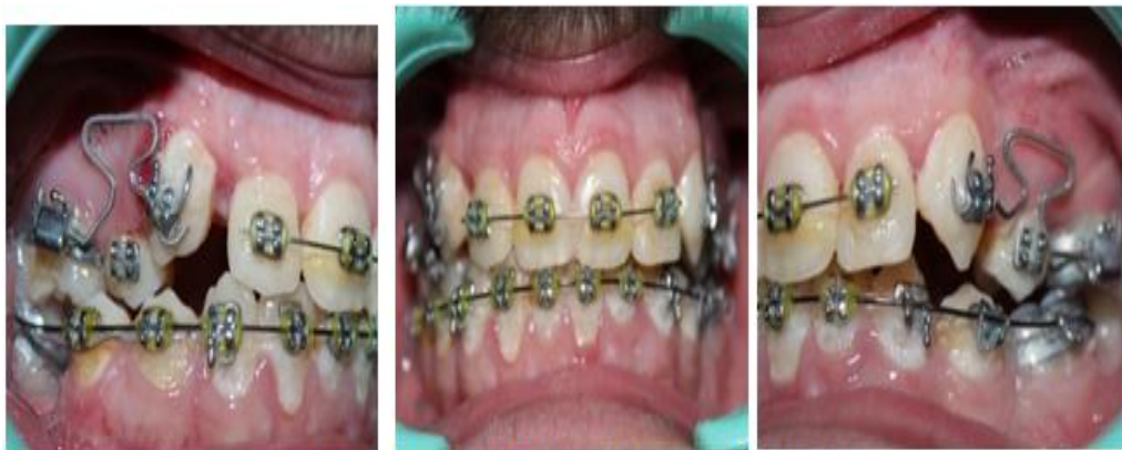
Fig. 4 : Canine Retraction by 17×25 TMA T-loop

III elastics were used to correct unilateral left Class III molar relation on 0.017×0.025" stainless steel archwires. Diagonal elastics were used simultaneously to correct lower midline in relation to the facial midline. After molar and midline correction, coordination of arches was done on 0.019×0.025" stainless steel archwires. A 0.016×0.022" NiTi archwire was placed for two months for finishing and detailing of occlusion. The treatment was completed in twenty one months. The case was debonded and maxillary and mandibular anterior bondable lingual retainer was given. The patient is being recalled every six months for follow up.