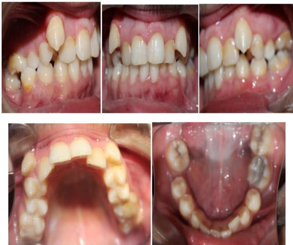
Fig. 2: Pre treatment intra-oral photographs