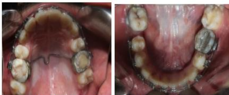
Fig. 6: Intra-oral photographs after space closure