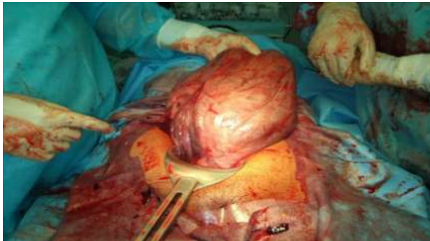
Fig 2: detorsion done. Ecchymosed right sided round ligament, fallopian tube and ovarian ligament due to torsion.