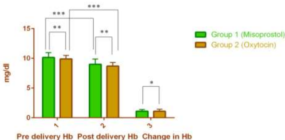
Fig 1: Comparison of mean±SD of pre and post delivery haemoglobin in group 1 and group 2