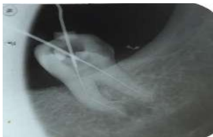
Figure 2: fractured file bypassed and working length determined