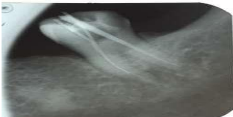
Figure 3: IOPAR of 38 with master cone