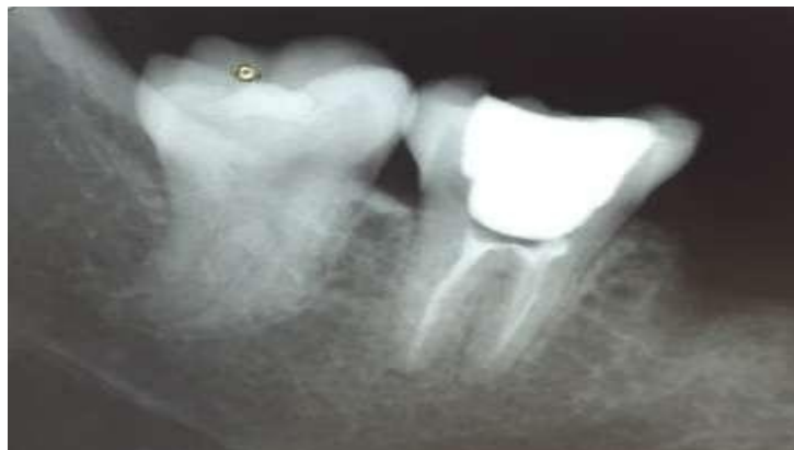
Figure 8: post obturation IOPAR of 47