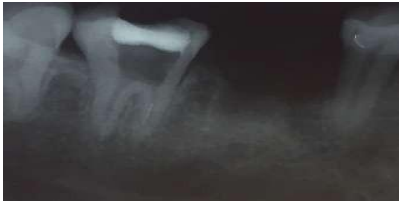
Figure5: a fracturedfileinthemesialcanalof47