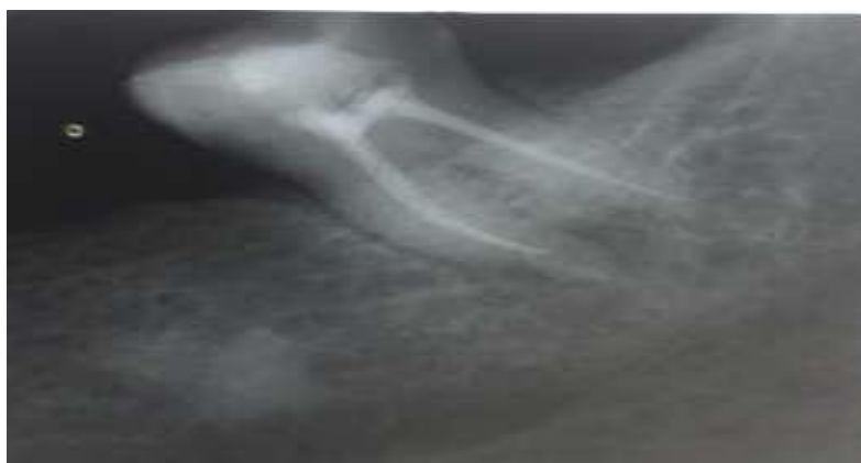
Figure 4: IOPAR of 38 after obturation