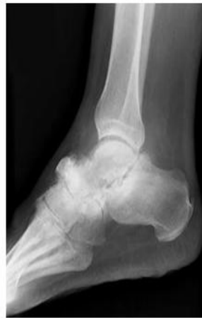
Fig1: Preoperative photograph and X-ray of the present case.