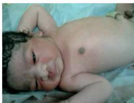
A 38 week baby weighing 3 kg without RDS. Skin was mature, pink with no adherent vernix. AFOD was 1.34. of vernix adherent. AFOD was 0.11