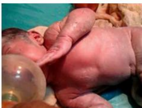
A 38 week baby weighing 3.2 kg with sternal retractions with respiratory distress. The skin was premature, thin, red with plenty