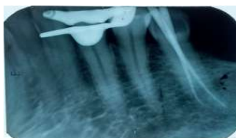
fig 3: master cone IOPA