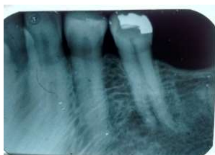
fig 1: preoperative IOPA radiograph