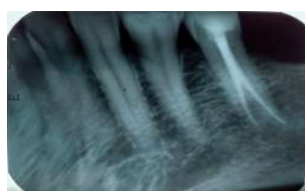
fig 4: post obturation IOPA