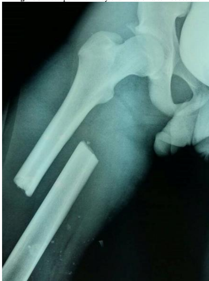
Figure 3 : Postoperative X-ray examination after reduction.

Few minutes after we have taken the patient to the operating room and under general anesthesia an attempt of closed reduction of the left hip was tried according to Böhler manipulation and it was surprisingly successful. Reduction was confirmed by an x-ray of the left hip ( figure 3 ).