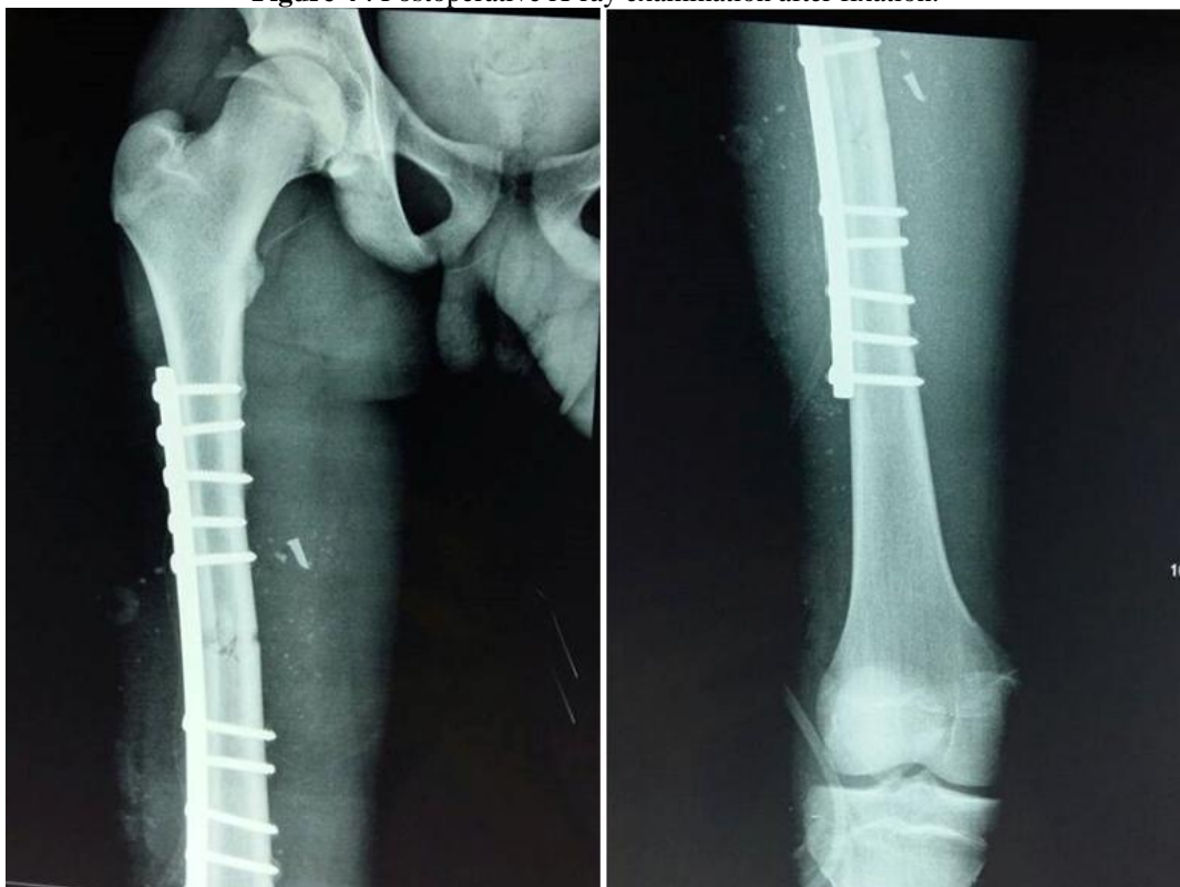
Figure 4 : Postoperative X-ray examination after fixation.

Post operatively the lower limb was immobilized in a Zimmer splint with hip in abduction. The patient was administered ketoprofen 100 mg and enoxaparin to prevent DVT deep vein thrombosis. He was followed with serial X-rays of hip and femur shaft. He used axillary crutches to walk with no weight bearing instruction for the first month. Progressively partial weight bearing was authorized till the fourth month. At the end of the fifth month we gave him permission of full weight bearing with a good range of movements. Our patient was undergoing sessions of physiotherapy at special center.