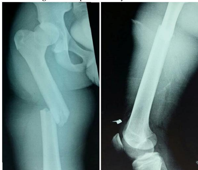
Figure 1: Preoperative X-ray examination.

After being stabilized, the patient went to the radiology service. X-rays were taken of both hips and femoral shaft of the left side ( figure 1 ).