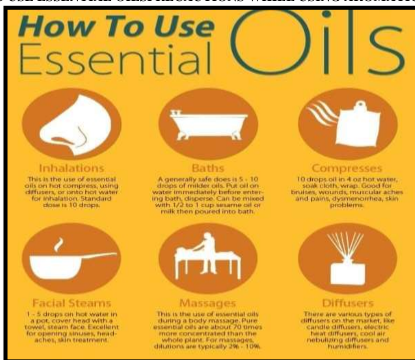
Fig 5 : How to Use Essential oils 5