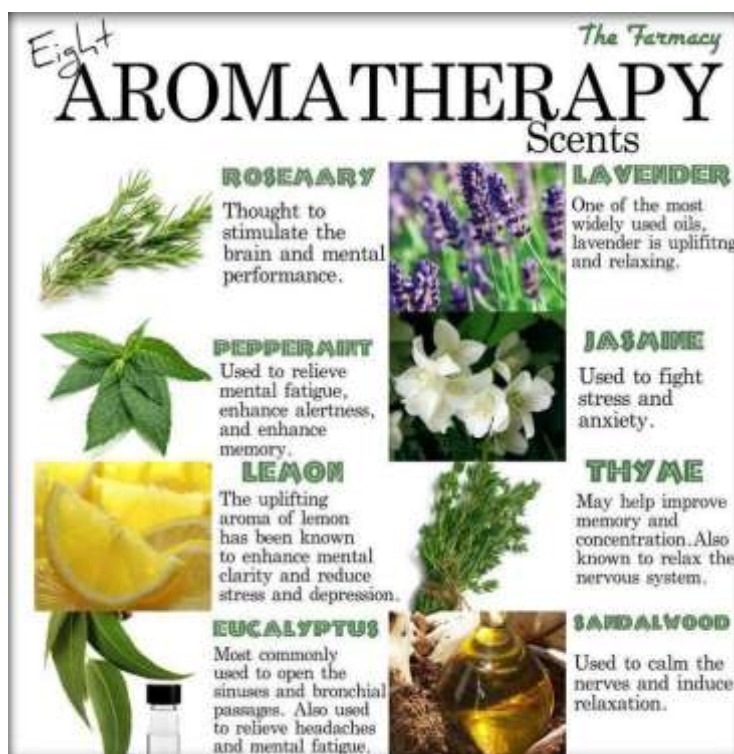
Fig 4: Most commonly recommended Aromatherapy

Aromatherapy can be a very helpful and effective adjunct to numerous treatment plans, but it is infrequently the primary approach of therapy. Therefore, a consultation with an aroma therapist will be needed in the situation of other medical treatment. The practitioner may also be an herbalist, or a homeopath. Aromatherapy is also often practiced at home, because the essential oils are stress-free and pleasant to use. Fig 4 summarizes the most commonly recommended Aromatherapy.