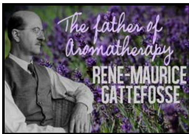
Fig 1: Father of Aromatherapy 3