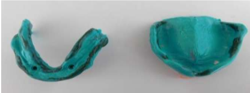
Fig. 6: Final impression of maxillary and mandibular arch.