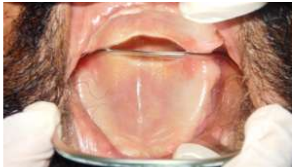
Fig.3 : Intraoral view of edentulous maxillary arch