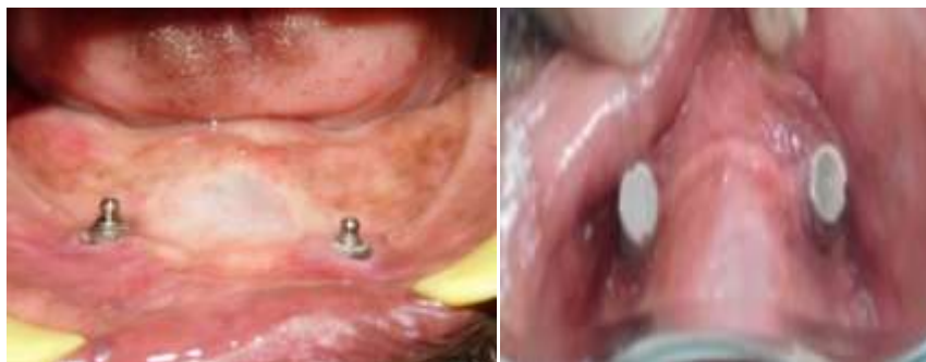
Fig. 5a and b: a. New overdenture ball abutment attached and b. with metal encapsulator