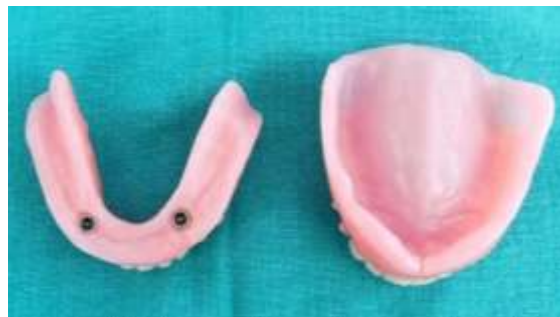
Fig.10: completed prosthesis with metal encapsulator incorporated into mandibular implant supported overdenture