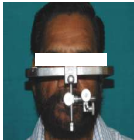
Fig.8 : Facebow transfer