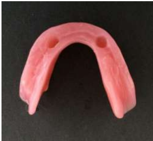
Fig.7: Mandibular permanent denture base