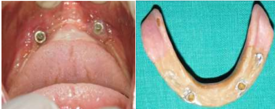
Fig. 1 and 2: Intraoral view of fractured overdenture ball abutments and Existing implant supported overdenture