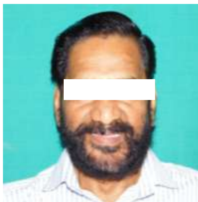
Fig.11 : Post-treatment Photograph