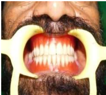
Fig.9 : Denture try-in