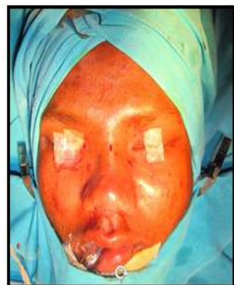
Fig 3: Operative photo showing that the patient is intubated orally and the incision was taken.