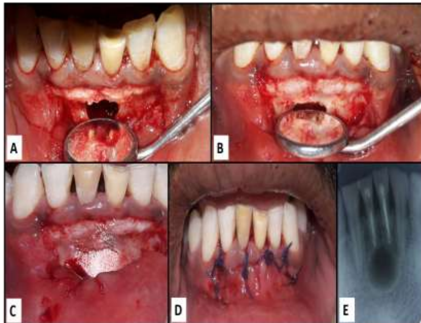
Fig 2: a) Flap reflection and bony window prepared, b) Root end preparation and resection in 31,41, c) Alloplastic bone graft placed after cyst enucleation, d) Interrupted sutures, e) Post MTA root end filling radiograph.