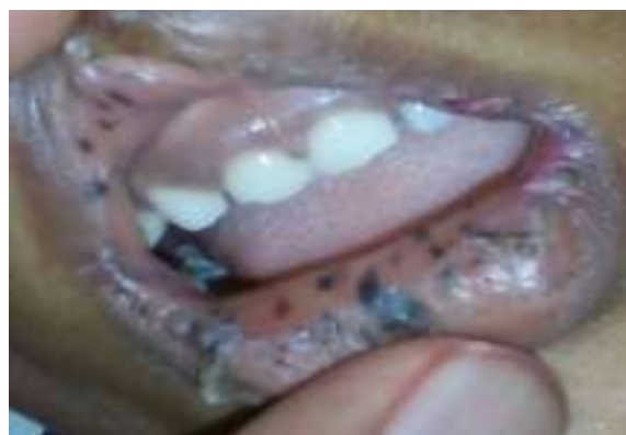
Fig 6 shows multiple mucocutaneous pigmentation on lip