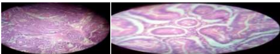
Fig 5 a Photomicrograph of magnification X100 hematoxylin-eosin stain demonstrates that Peutz-Jeghers polyp characteristically contains a core of arborizing smooth muscle, upon which rests mucosa that is crevate to the site of the polyp, in this case small bowel mucosa. 5b. Photomicrograph shows that this large Peutz-Jeghers polyp includes nests of benign mucosa that are located in the submucosa and muscularis propria with hyperplastic epithelial misplacement.