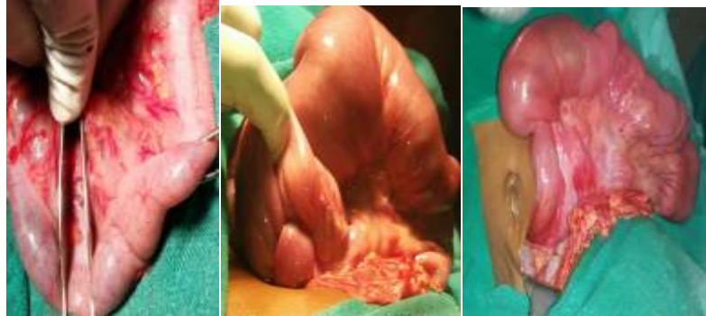
Figure 3.a Intraoperative photograph shows the multiple polyp on sigmoid region, 3b. transition zone of the intussusceptions on high jejunum-jejunal region, which was caused by a lead-point polyp. The intussusceptum is dilating and obstructing the intussusciens with jejunal multiple polyp, 3c another patient showing high jejunal intussusceptions.

intussusception mass with central low-attenuation fat, which is being dragged into the intussusciens by the intussusceptum