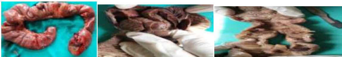
Figure 4.a Photograph of the gross bowel specimen demonstrates the lead-point polyp with several smaller polyps aggregated at the base of the dominant polyp, with intussusceptions. 4b. gross bowel specimen demonstrates the lead-point polyp with intussusception. 4c multiple jejunal polyps with necrosis