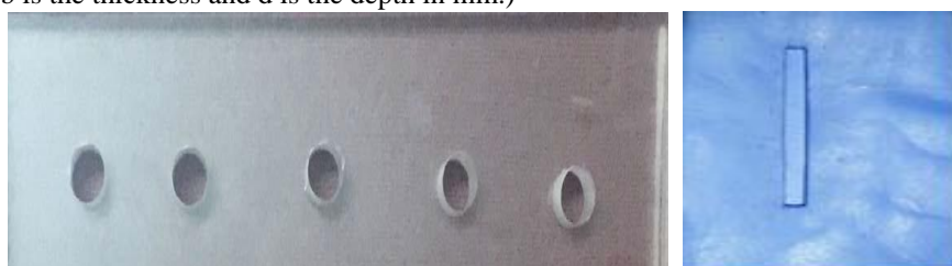
Figure 1,2 – Mould For Compressive And Flexural Strength Test