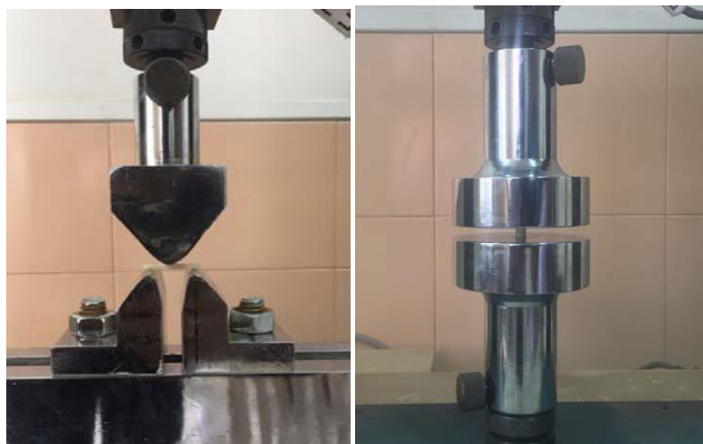
Figure 5,6 –Specimens Subjected To Load On Universal Testing Machine