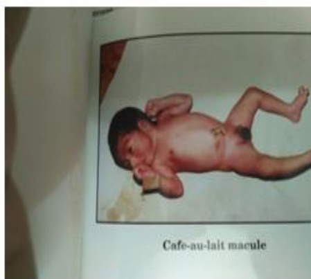
Cafe - au - lait macule