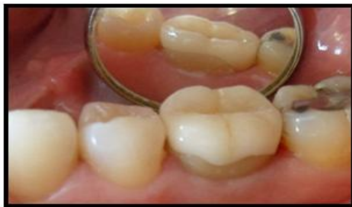
Figure 7: Clinical view after bonding the endocrown