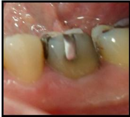
Figure 1: Severely damaged molar with amalgam and provisional restoration.

Bonding was performed using a dual curing self-adhesive permanent resin (TOTALCEM ®). A thin layer was applied to the prosthetic endocrown, which was positioned, and polymerized at intervals of 5 seconds on the free surfaces, making it easy to remove cement excesses. Afterwards it was polymerized for 60 seconds on all surfaces (Figure 7). Then, occlusion contact was checked in order to have no area contact when dynamic occlusion. If there is contact, rectifications must be followed by a polishing.