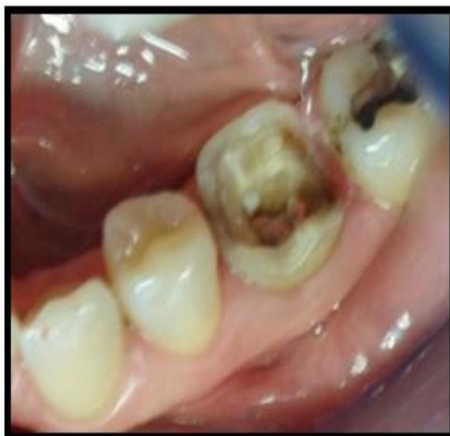
Figure 3 : Molar preparation