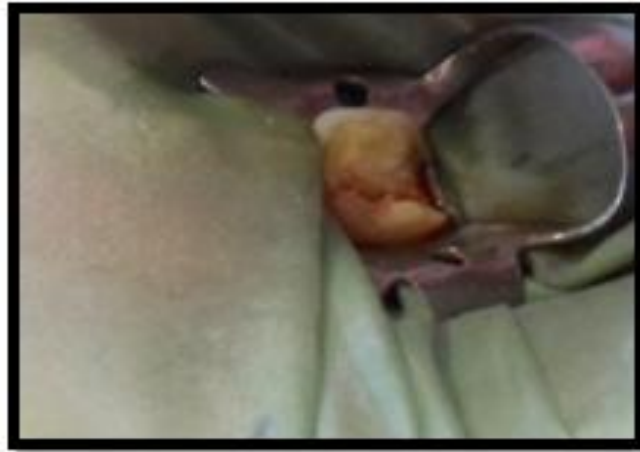
Figure 6 : Molar isolation before endocrown bonding