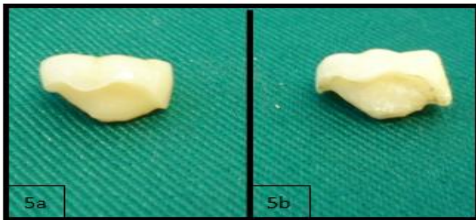
Figure 5a : Definitive prosthesis