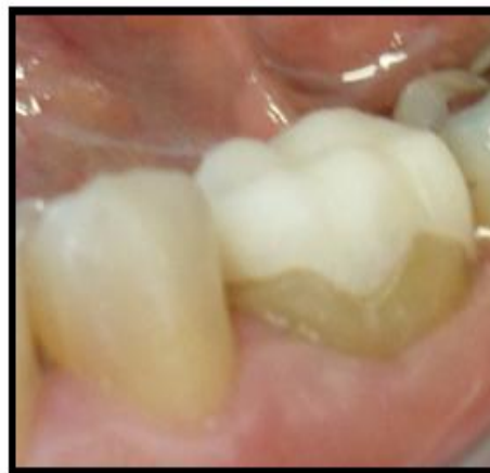
Figure 4 : Provisional prosthesis