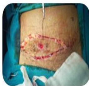
fig.2 Incision circumscribing the ulcer