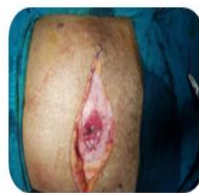
fig.3 Excised disc of rectus sheath to achieve negative margins