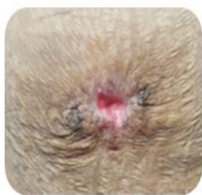
fig.1 2x2 cm Ulcer seen in suprapubic region