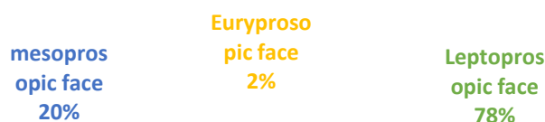
Figure 3. The percentage of each facial type in both genders

As shown in fig. 3, after obtaining the facial index of each subject, the leptoprosopic facial type (36 males, 28 females) was the predominant facial type followed by the mesoprosopic type (4 males, 12 females) and the least one was the euryprosopic facial type (2 females); therefore the euryprosopic facial type was excluded from the sample, this is comes in line with Jeremić and Kassab.[6, 13]