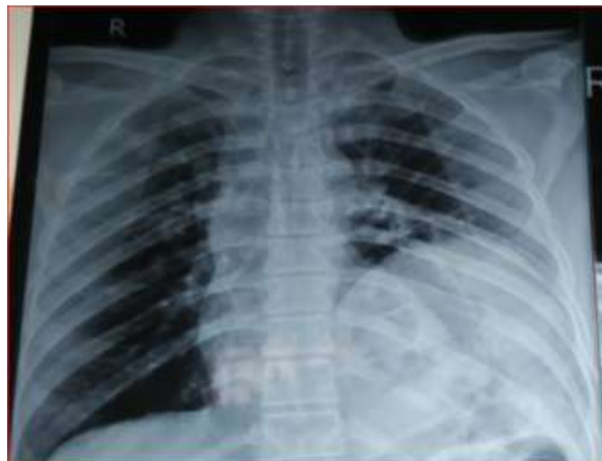
Fig .1 Chest X ray showing Elevated Left dome of the diaphragm