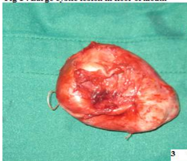
Fig.3 : Well circumscribed cystic lesion