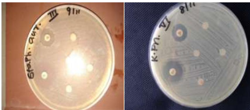
Table 3: Antifungal test of isolates from Al-khoms teaching hospital.