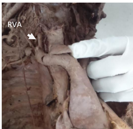
Fig:2 showing normal course of RVA passing through C6 foramen transversarium