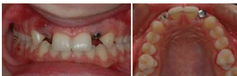
Figure 3a-b; Treatment Progress (Surgical Implant Placement)

The treatment of MLIA patients with implants is considered an innovative, more conservative approach, which preserves the morphological features of canines and first premolars, as there is no need to reshape sound adjacent teeth.[5,7,9,10]