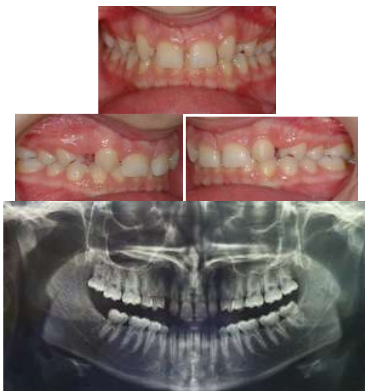
Figure 1a-d;Pre Treatment Intra Oral Photographs

The single-tooth implant has become the most popular treatment alternative for the replacement of missing teeth. Various studies have shown the successful osseointegration and long-term function of restorations supported by single-tooth implants. In addition to the high success rates, one main benefit of this type of restoration is that it leaves the adjacent teeth untouched. This is particularly important in young patients and unrestored dentitions. It is true that implant-supported restorations are not without potential problems. These problems range from mechanical complications to biologic changes that can impact their long-term predictability[9,10] However, if the proper surgical and restorative protocols are followed, potential complications or esthetic compromises are minimal. To achieve a stable esthetic and healthy outcome with dental implants, it is beneficial to understand their effects on the surrounding hard and soft tissues.[5,6,9,10,11]