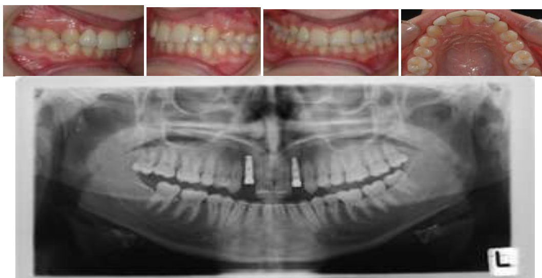
Figure 4 a-e; Post Treatment intraoral Photographs

The gingival contour and interdental space filling with papilla comprise important aspects in the esthetic perception of the smile . In general, in implant treatments, these aspects are related with the implant position in regard to the gingival margin. In adult patients, the alveolar bone is usually positioned 2 mm apical to cemento enamel junction, which favors implant placement. In younger patients, however, the alveolar bone is frequently at the level of the cemento enamel junction, which requires the performance of periodontal surgical procedures . In relation to the gingival papilla, space opening is more predictable in young patients.[13-18]