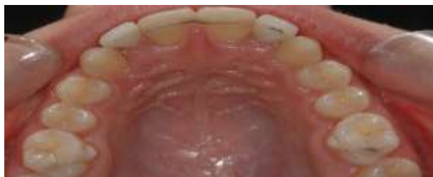
Figure 5; Post Treatment intraoral Photographs

gingival retraction, and abutment exposure . However, with the use of switch-design implants with narrow diameters or platforms, the effects of bone remodeling may be minimized . Besides, with the new advances in customized zirconia components, all-ceramic implant-supported restorations may be used to replace absent lateral incisors, reducing the esthetic impact in cases the tissue around implants shift positions over time.[21,22,23,24]