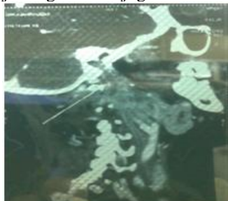
Fig 2: CT picture showing Right side IJV thrombosis

CT was done to know the extent of the abscess. CT revealed a suppurating lymph node on the right side of the neck and thrombosis of the adjoining internal jugular vein.