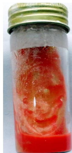
Fig 2. Orange coloured colony of Rhodotorula on SD agar