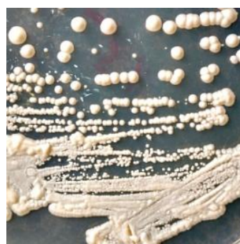
Fig 4. Mucoid colony of S.ciferrii