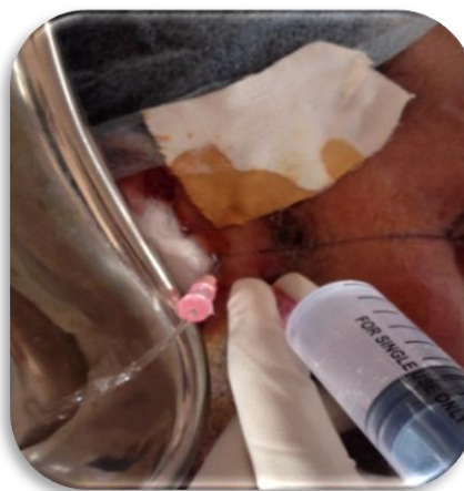
Fig 2: Lavage