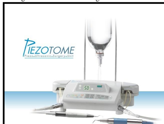
Fig Shows: Schematic Diagram of Piezotome

With the help of piezotome Both mesial and distal osteotomy lines were joined with the third horizontal osteotomy line in order to remove the collar of bone on the buccal aspect of third molar. Sectioning of tooth if required was done using rotary handpiece in cases where the roots had conflicting lines of withdrawal or third molar crown locking existed (in both group A and B). After obtaining adequate haemostasis, the wound was closed without tension, with 3-0 black silk sutures.