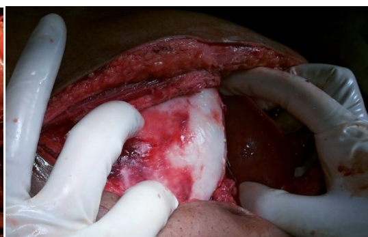
Fig 2: Abgel placement