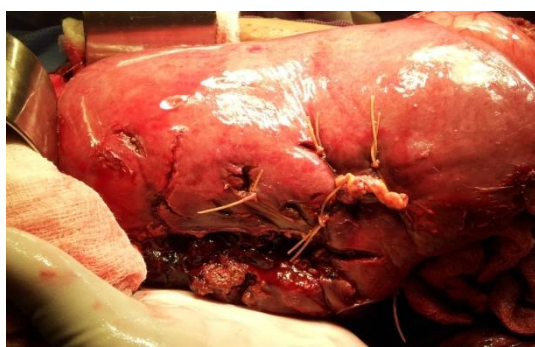
Fig 1: Hepatorraphy

More than one surgical technique was used to secure surgical hemostasis. 92.5% (37/40) Hepatorraphy with or without gel foam augmentation is for surgical Hemostasis. Peri-hepatic packing is used in 12.5% (5/40) of patients.