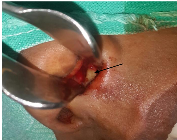
Figure 3: Intra-op picture showing tooth in floor of nasal septum (arrow)