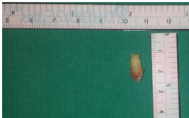
Figure 4: Extracted supernumerary tooth (15 mm length)