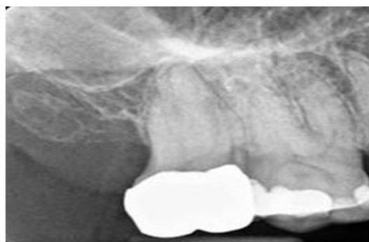
Fig 3: Following the placement of a full gold crown on the maxillary right second molar, the patient complained of sensitivity to both hot and cold liquids; now the discomfort is spontaneous. Upon application of Endo-Ice on this tooth, the patient experienced pain and upon removal of the stimulus, the discomfort lingered for 12 seconds. Responses to both percussion and palpation were normal; radiographically, there was no evidence of osseous changes. Diagnosis: Symptomatic irreversible pulpitis normal apical tissues.

Asymptomatic Irreversible Pulpitis is a clinical diagnosis based on subjective and objective findings indicating that the vital inflamed pulp is incapable of healing and that root canal treatment is indicated. These cases have no clinical symptoms and usually respond normally to thermal testing but may have had trauma or deep caries that would likely result in exposure following removal. 6