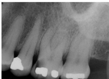
Fig 2: Maxillary left first molar has mesio-occlusal caries and the patient has been complaining of sensitivity to sweets and to cold liquids. There is no discomfort to biting or percussion. The tooth is hyper-responsive to Endo-Ice with no lingering pain. Diagnosis: reversible pulpitis; normal apical tissues.

Reversible pulpitis is a mild to moderate inflammatory condition of the pulp caused by noxious stimuli in which the pulp is capable of returning to the uninflamed state following removal of the stimuli. Discomfort is experienced when a stimulus such as cold or sweet is applied and goes away within a couple of seconds following the removal of the stimulus. 6