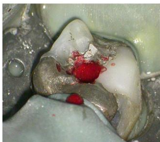
Fig 1: Pulp exposure

The dental pulp is a connective tissue consisting of nerves, blood vessels, ground substances, interstitial fluid, odontoblasts, fibroblasts, and other cellular components. Historically, there have been a variety of diagnostic classification systems advocated for determining endodontic disease. 1 Unfortunately, the majority of them have been based upon histopathological findings rather than clinical findings, often leading to confusion, misleading terminology, and incorrect diagnoses. 2 A key purpose of establishing a proper pulpal and periapical diagnosis is to determine what clinical treatment is needed. 3,4 For example, if an incorrect assessment is made, then improper management may result. This could include performing endodontic treatment when it is not needed or providing no treatment or some other therapy when root canal treatment is truly indicated.