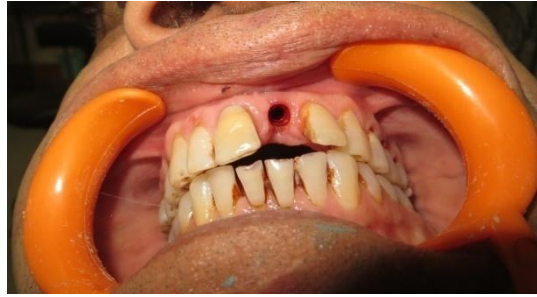
Fig.7 Healed gingival cuff for emergence profile (Case1)