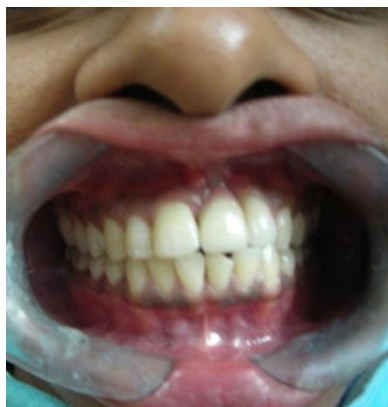
Fig.19 Prosthesis in situ with pink porcelain close up view (Case 2)