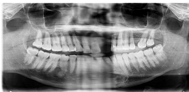
Fig.2 Orthopantogram showing missing left upper central incisor (Case1)