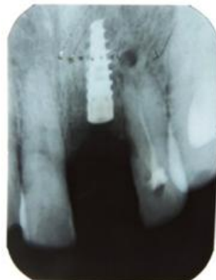
Fig.5 IOPA showing the position of implant (Case1)