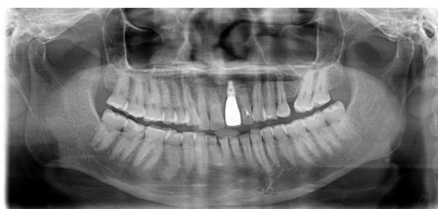
Fig.13 Postoperative IOPA after 2 years of follow up (Case1)