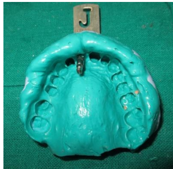
Fig.9 Implant level impression using closed tray technique showing impression coping and implant analog (Case1)