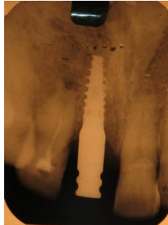
Fig.8 Position of the impression coping verified with IOPA radiograph (Case1)