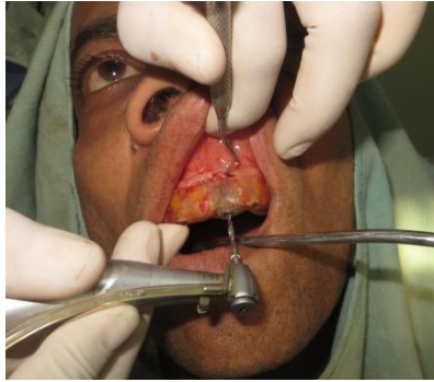
Fig.3 Pilot drill with surgical template (Case1)