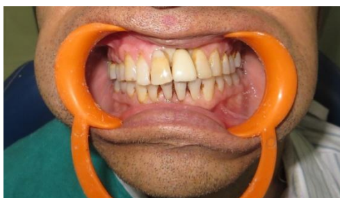
Fig.12 Definitive prosthesis in place (Case1)