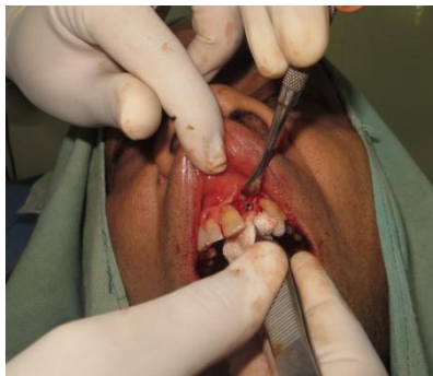
Fig.4 Implant placed at prepared osteotomy site (Case1)