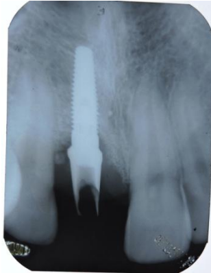
Fig.16 IOPA X ray with modified angulated abutment (Case 2)