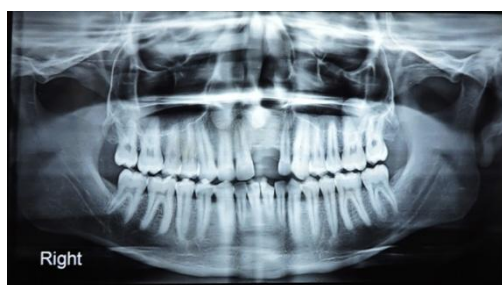
Fig.14 Preoperative Orthopantogram X ray (Case 2)