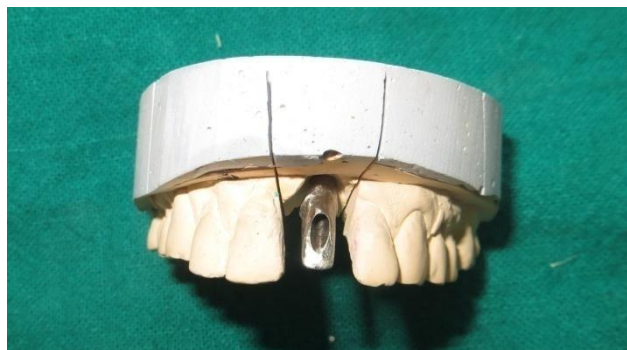
Fig.10 Customised cast abutment using UCLA abutment with gingival mask (Case1)