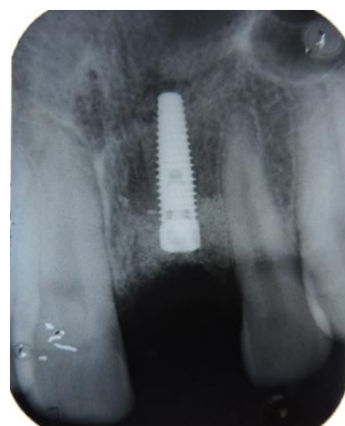
Fig.15 IOPA X ray with implant (Case 2)