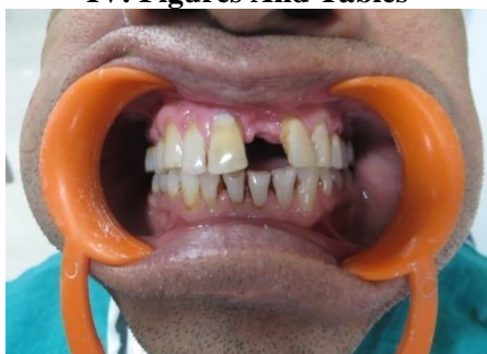
Fig.1 Intraoral picture showing increased cervicoincisal edentulous space in left upper central incisor (Case 1)