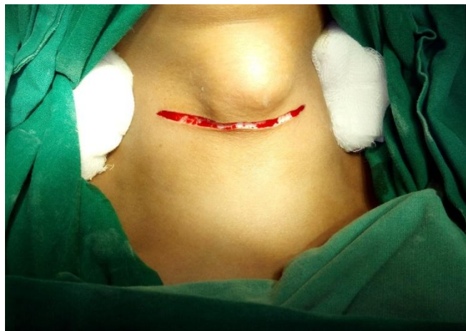
Figure.1 Single cosmetic neck incision along lower skin crease