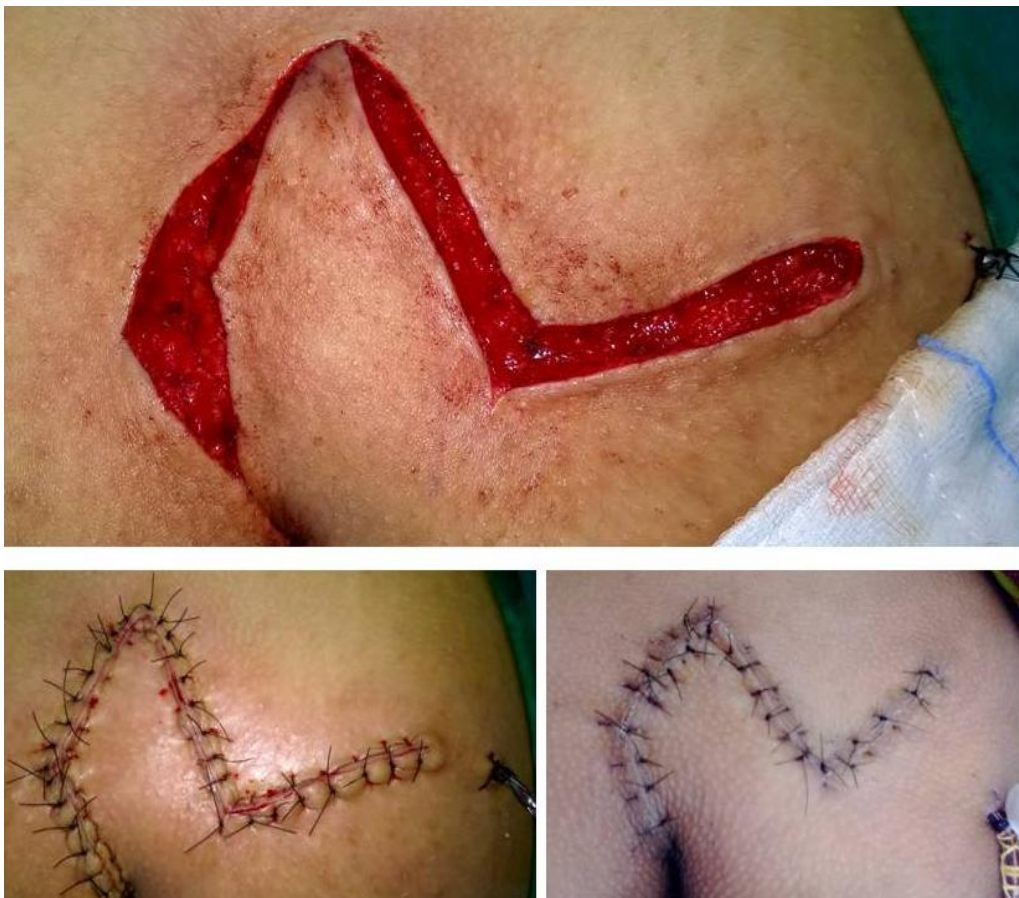
Figure 3 ; Approximation and closure of the defects with Limberg Flap by suturing with 3 – 0 Ethilon.