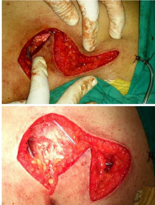
Figure 2 : Advancement of Rhomboid flaps.