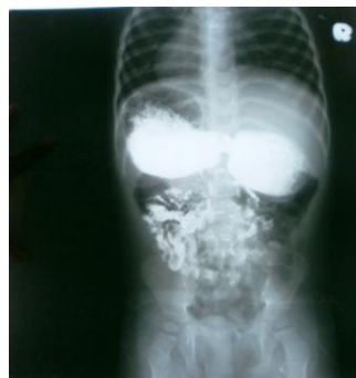
Gastrointestinal contrast showing Duodenal Atresia