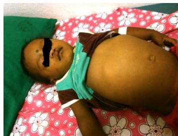
Duodenal Atresia with Down Syndrome and cleft lip

A 2year male child weighing 7 kg referred with complaints of bilious vomitings.no antenatal usg done.there was developmental delay and features of Down syndrome,cleft lip( partial) on left side,upper abdominal fullness and systolic cardiac murmer.plain radiograph of abdomen revealed double –bubble sign with sparse distal gas shadows.upper gastrointestinal contrast study confirmed duodenal atresia.echo detected Atrio ventricular septal defect.after adequate preparation we did laparotomy by supraumbilical transverse muscle cutting incision and the findings were type1 duodenal atresia with a wind sock deformity and malrotation. We did Ladd's procedure and duodenotomy by vertical incision, excised the membrane and closed the duodenotomy transversly and kept a flank drain.child recovered uneventfully and discharged on 7 th post operative day.