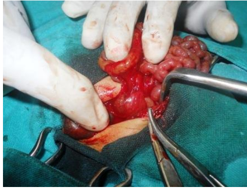
Operative photograph showing Ladd's bands