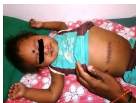
Post operative scar