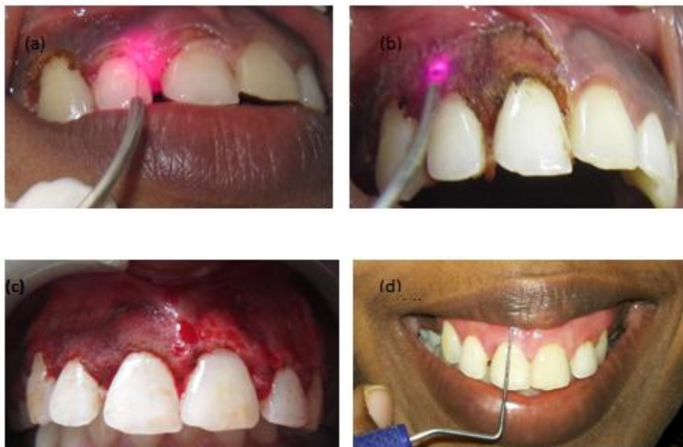
a)Diode laser assisted crown lengthening b)De-pigmentation using diode laser c)Immediate post operative d)One month post operative showing the excessive gingival display.

Here the fiber-optic hand piece was held in contact mode on to the tissue .Laser ablation started from the muco-gingival junction toward the free gingival margin, including papillae. The motion of ablation was circular with overlapping circles. High attention was taken to avoid passing the laser beam on teeth structures and over mucosa. The ablation of the gingiva was completed within 20 to 25 minutes .There was no need to apply a periodontal dressing. patient were instructed to avoid eating of hot and spicy foods for the first 24 hours. Normal oral hygiene procedures were performed by all patients.