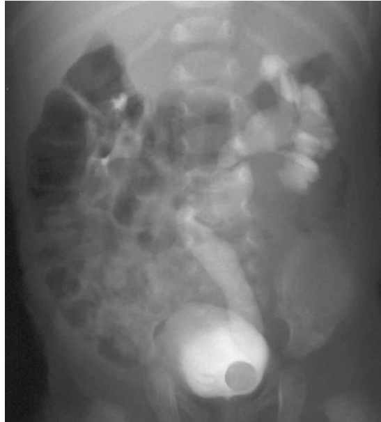
Fig.3: Intravenous pyelography.

After transeurethral unroofing and removal of calculi after crushing, patient was discharged uneventfully. She was advised for serial monitoring of renal function, periodic evaluation of voiding symptoms and bladder function. Interval radiologic studies to assess hydroureteronephrosis and vesicoureteral reflux were also advised.