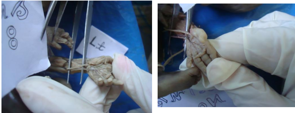
Fig 1: 20 th week old foetus showing incomplete superficial palmar arch formed entirely by the ulnar artery.