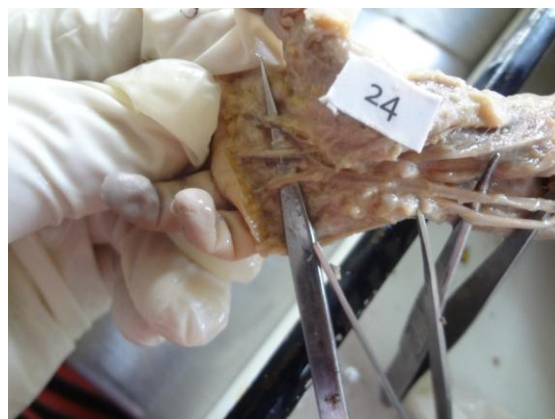
Fig 4: 34 th week old foetus showing incomplete superficial palmar arch formed by ulnar artery.