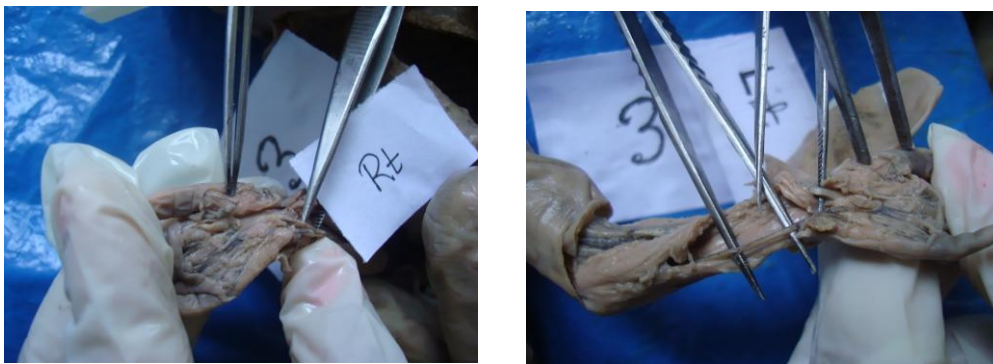
Fig 3: Incomplete superficial palmar arch formed by anastomosis between ulnar artery and superficial branch of radial artery in 22 weeks old foetus.