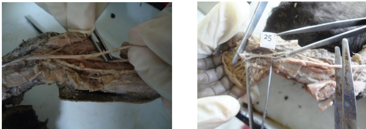
Fig 5: 38 th week old foetus showing the median artery piercing the median nerve.