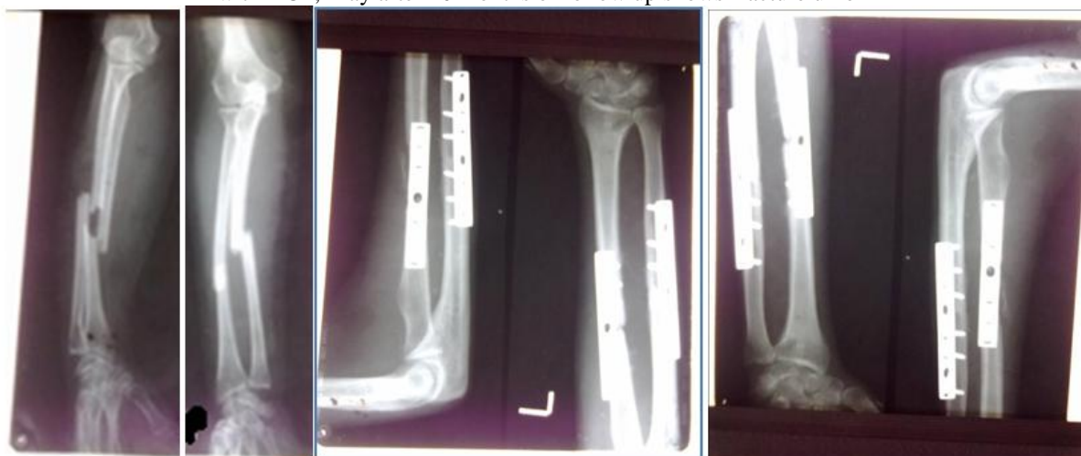
Figure 1: Preoperative x-ray shows fracture of both bones, immediate postoperative x-ray following fixation with DCP, x-ray after 10 months of follow up shows fracture union